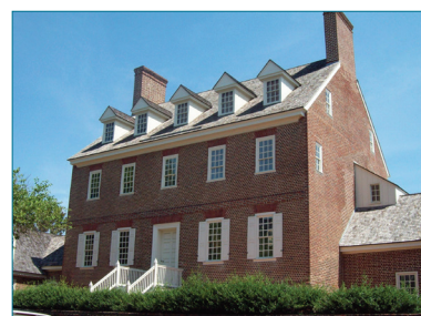
William Paca House 186 Prince George St. • Annapolis, MD